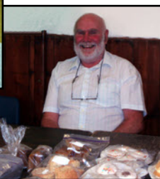
A rose between two thorns?